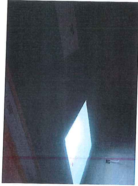
Ceiling boarding and access hatch works.