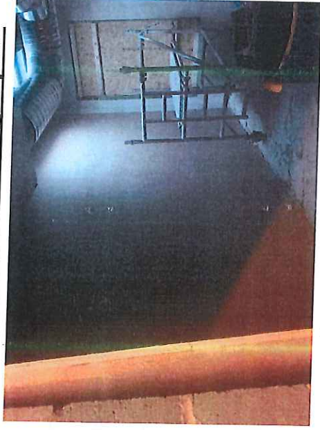
Plant room plastering works.