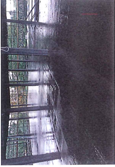
1 st Floor Concrete