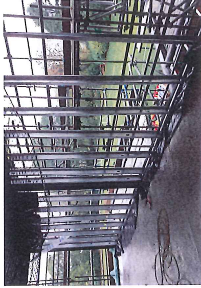
Structural Framing System