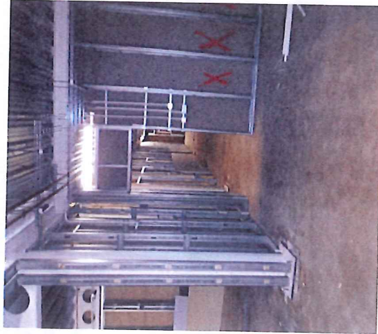
Main extension partitions being formed