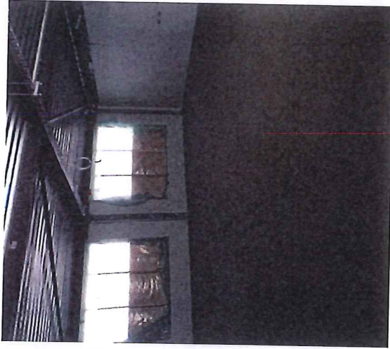
Hall extension 1 st floor screed complete