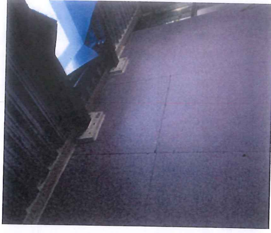
Internal Fire stopping example

Balfour Beatty & all of our sub-contractors would like to take this opportunity to wish you and your family a